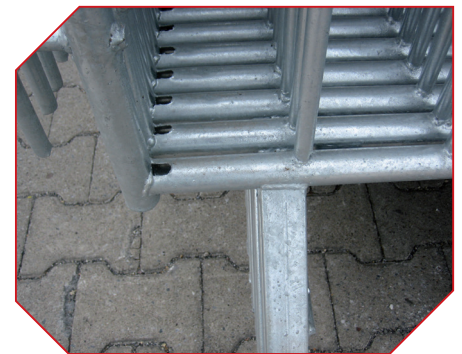
Galvanized barrier (zinc boreholes)