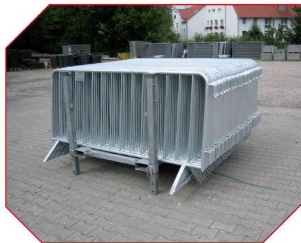
46 BFAG.net® barriers on the STG 35 pallet